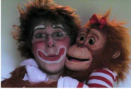
Ribbons the Clown & Niki

FREE downloads at www.RibbonsTheClown.com